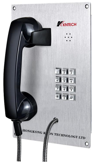
Analogue KNZD-07A auto dial Telephone